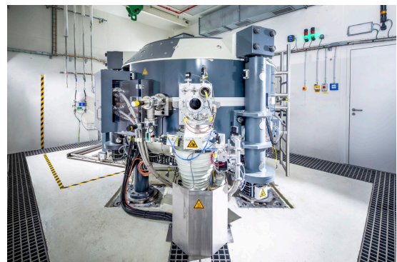
S2C2, the accelerator at the heart of PHENICS

As well as hosting Belgian and international research academic teams, the Centre aims to develop a range of services for companies. Companies testing the radiation resistance of electronic components and systems will find the Center an ideal, easily accessible environment in which to conduct their high-energy proton measurement campaigns and support their teams. Labs, workshops, qualified personnel in electronic irradiation as well as convenient booking and opening hours are some of the center's advantages.